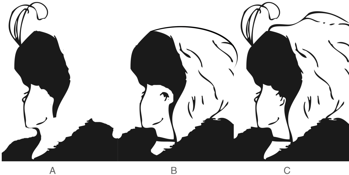
Figure 1: My Wife and Mother-in-Law by W.E. Hill (after Covey, 1990, p. 26).

What can be considered further evidence for this theory, is seen in our sense of visual perception. A Harvard Business School instructor brought a stack of cards to a lecture (see Figure 1). Half of them had picture A printed on them, and the rest had picture B. One stack was passed out to the right side of the audience, and the other half was passed out to the left. The students were told to study the picture for ten seconds and hand it back in. Picture C was then projected on a big screen, and the students were to describe the illustration. Almost everyone saw the person they had seen on their initial cards, and a big discussion followed. Half the group thought she was a 20-year-old girl with a feather in her hair; the other half saw an old, crooked woman (Covey, 1990). What had happened was that their brains had formed a pattern for that particular picture, leading to a conclusion of what the picture was of. When the third picture was shown, they instinctively fit the picture into the created pattern, and they